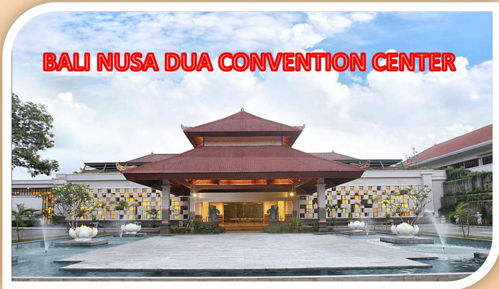
BALI NUSA DUA CONVENTION CENTER